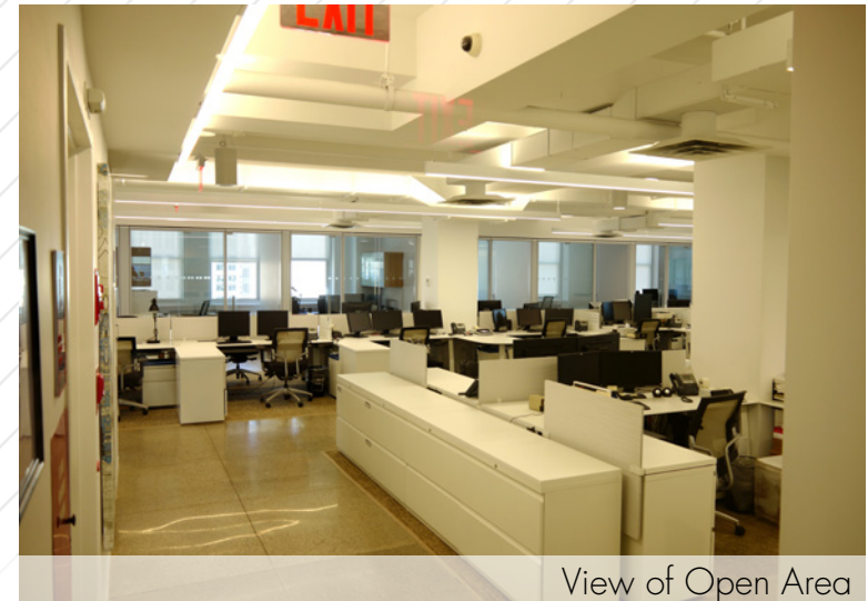
View of Open Area