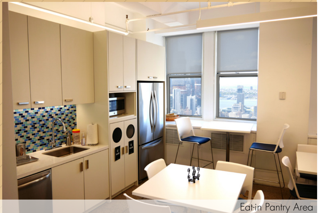
Eat-in Pantry Area