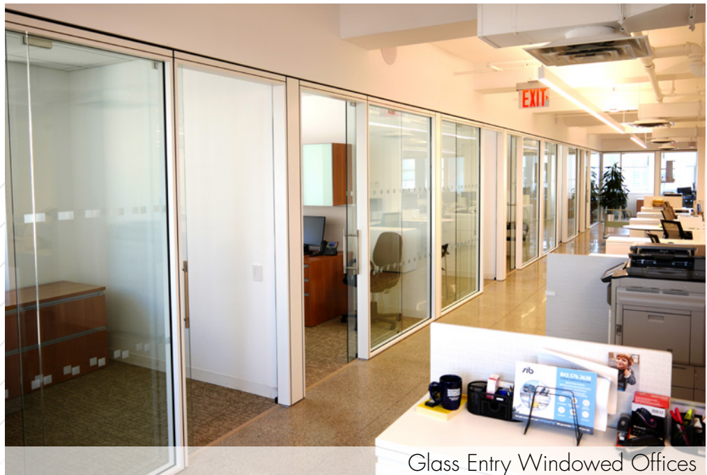
Glass Entry Windowed Offices