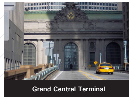
Grand Central Terminal