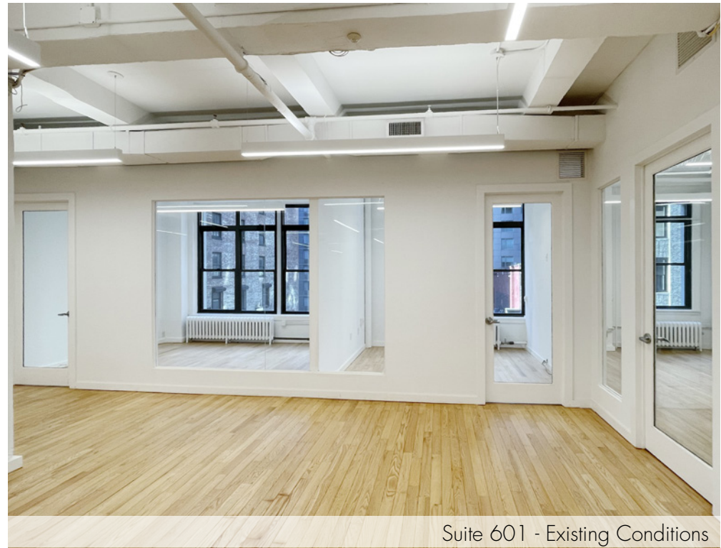
Suite 601 - Existing Conditions