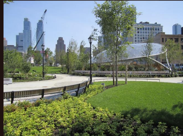
2 minute walk to Hudson Parks & Blvd

Suite 520: 4,402 RSF - Built with 7 offices, 1 conference room and wet pantry