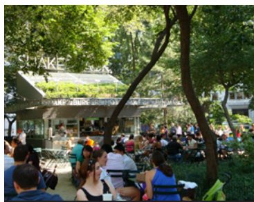
Madison Square Park