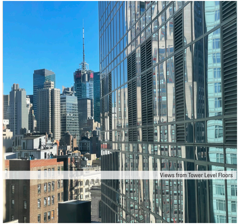
Views from Tower Level Floors

Entire 2nd Fl: 5,000 RSF Upon Req. Immediate