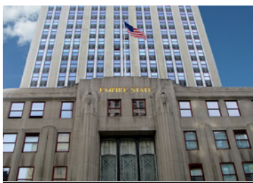
Empire State Building