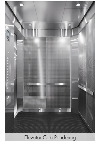
Elevator Cab Rendering

Planned upgrades to lobby/elevators • Accessible via Times Square and Herald Square subway hubs with access to 7 B D F M N Q R W trains