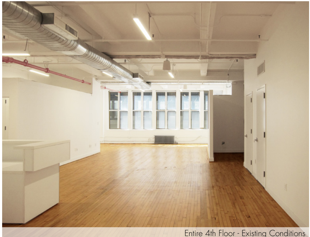
Entire 4th Floor - Existing Conditions