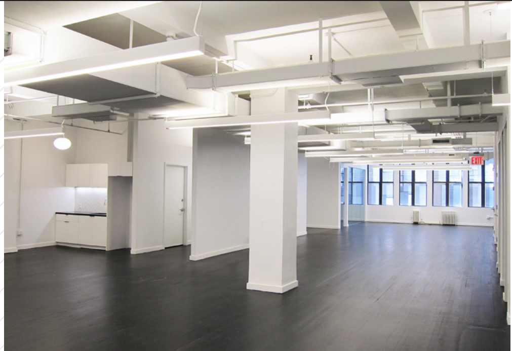
8th Floor - Existing Conditions