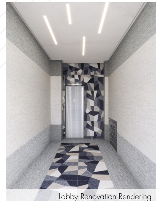
Lobby Renovation Rendering