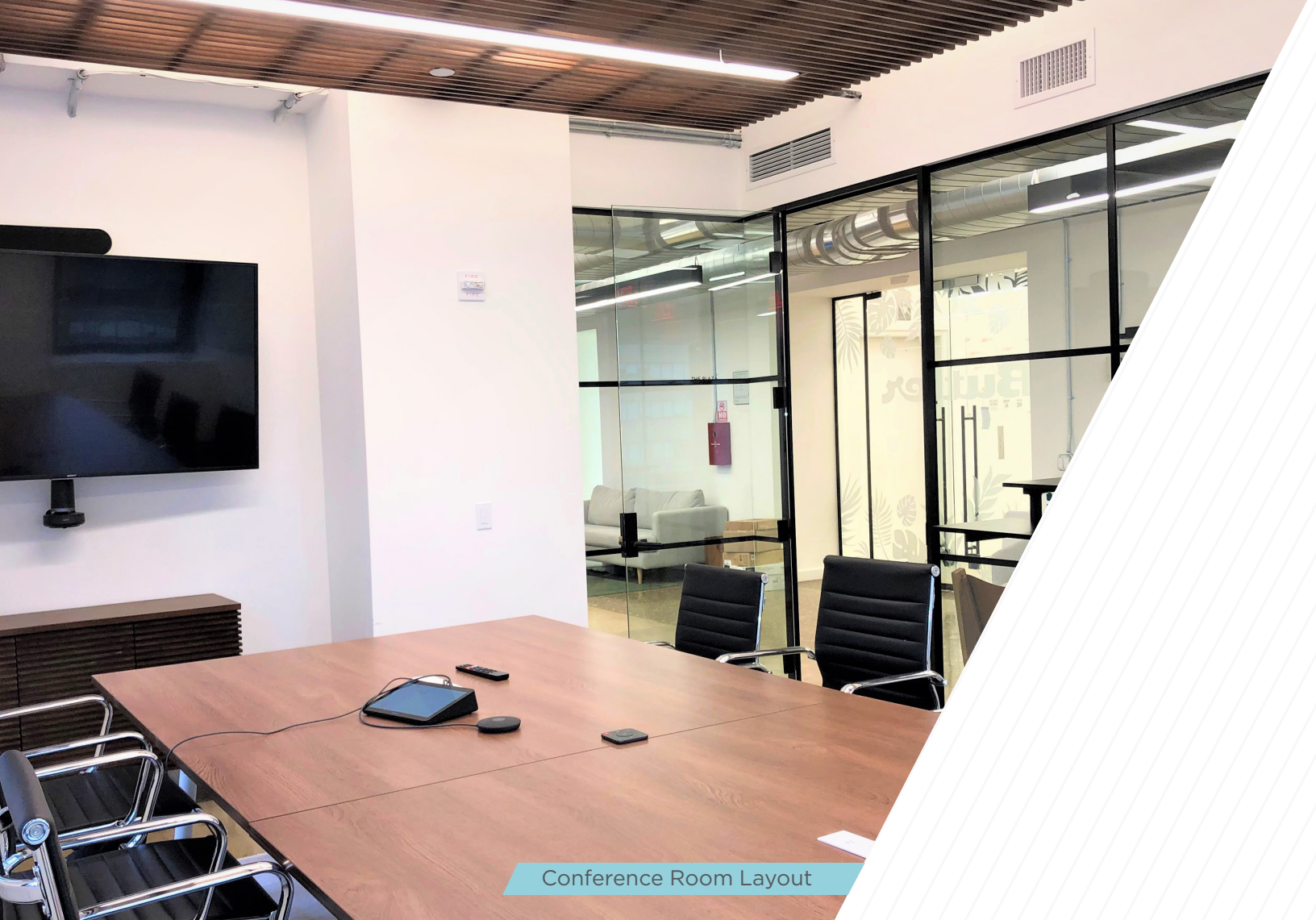
Conference Room Layout