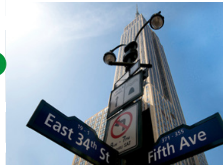
Empire State Building