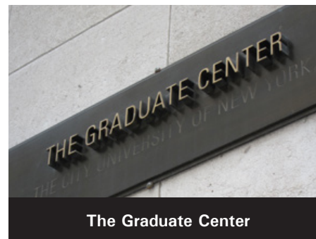
The Graduate Center