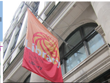
New York Public Library