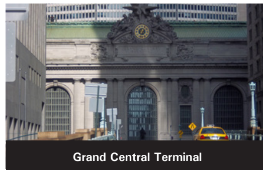
Grand Central Terminal