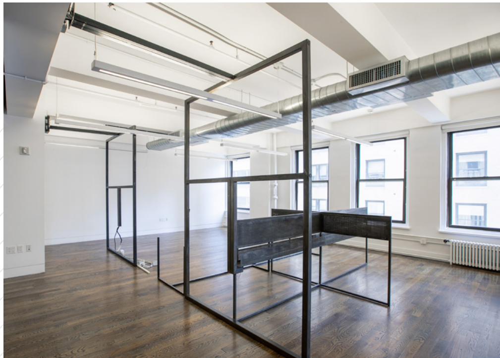
Suite 1001 - Existing Conditions

Suite 1001: 6,502 rsf - Move-in condition corner unit