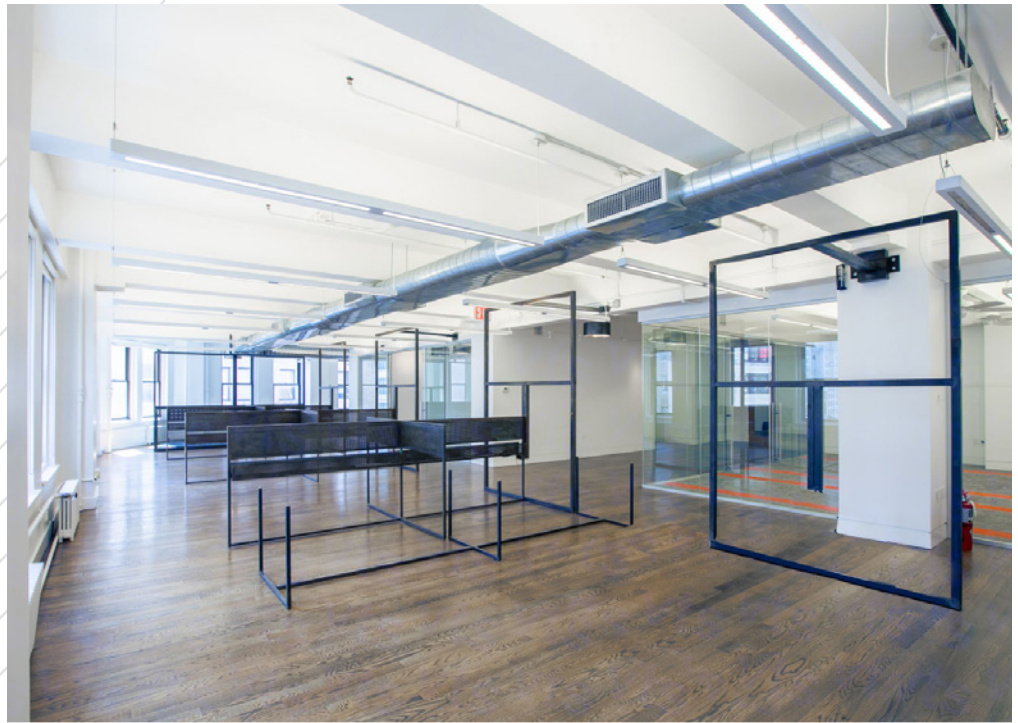
Suite 1001 - Existing Conditions