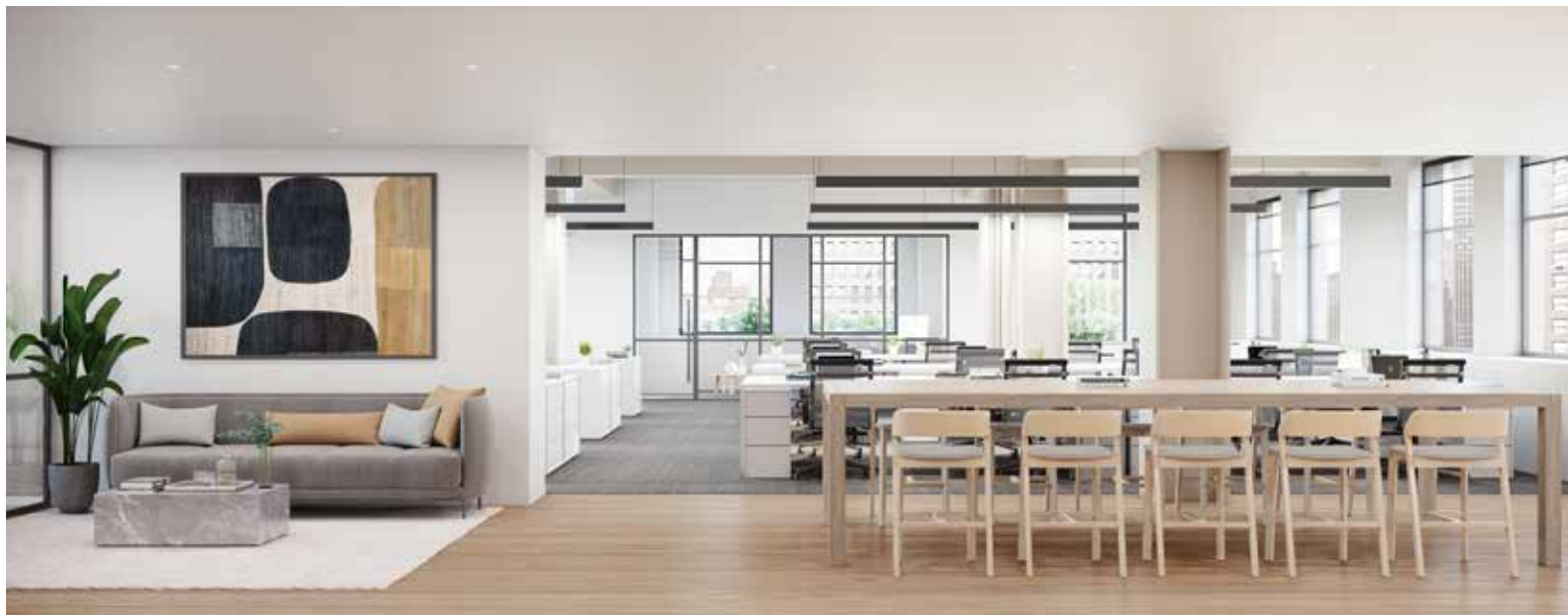
24th Floor Open Office