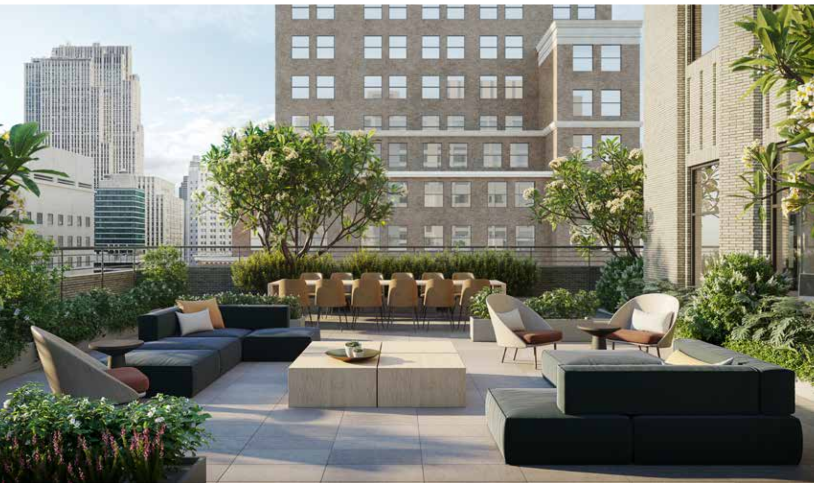
24th Floor Terrace