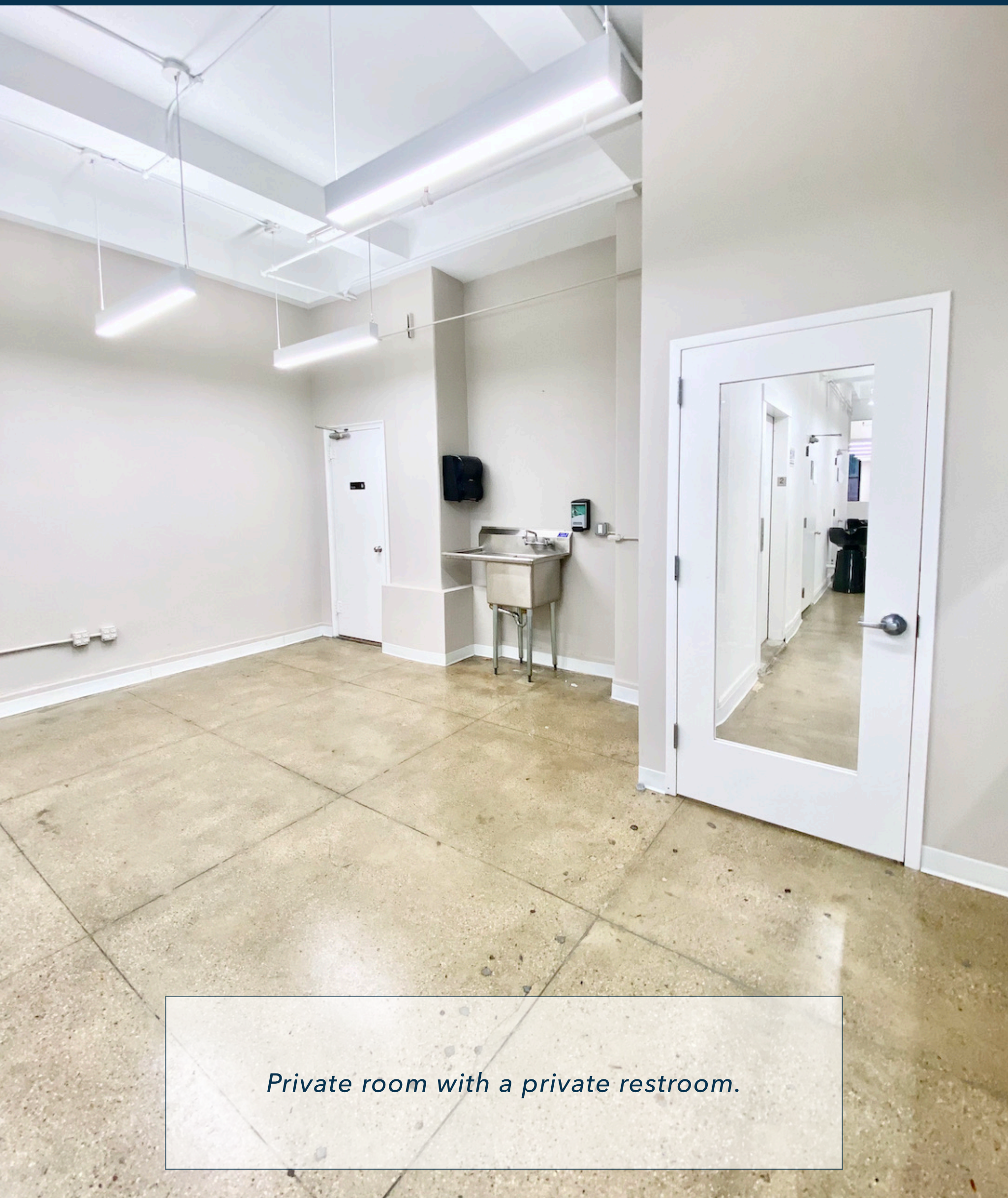
Private room with a private restroom.