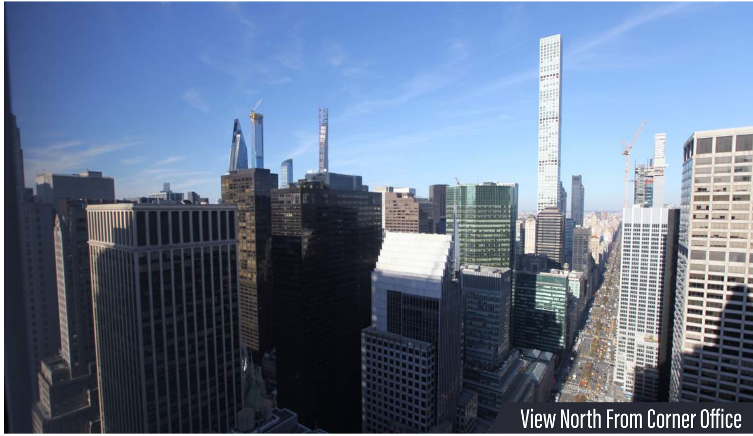
View North From Corner Office