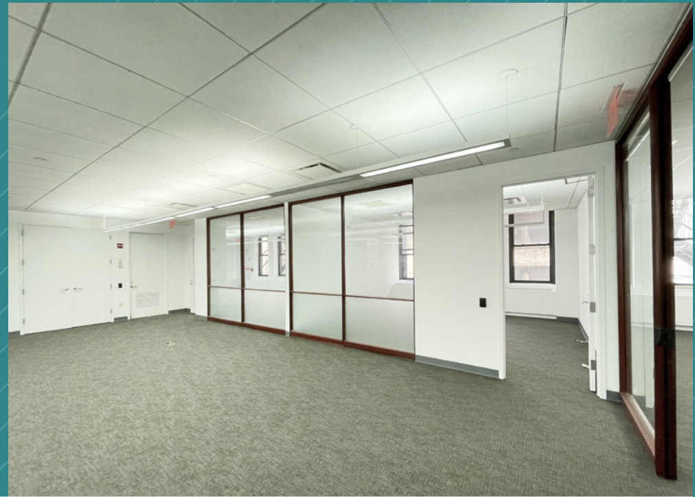
Entire 9th Floor - Glass-Front Spaces