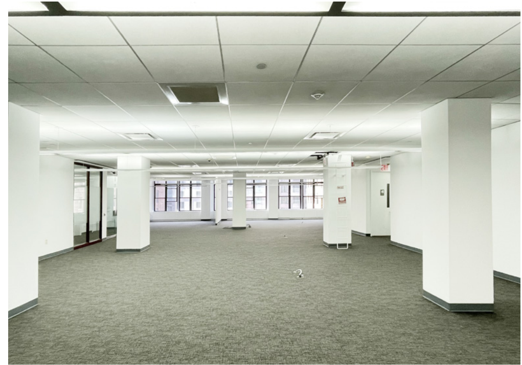
Entire 9th Floor - Existing Conditions