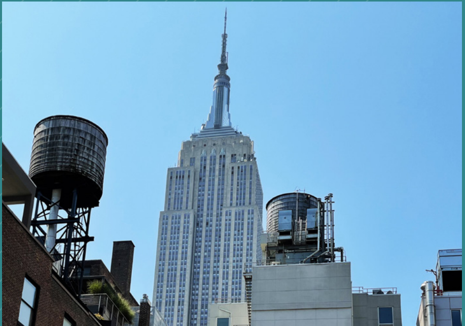
North / South Views