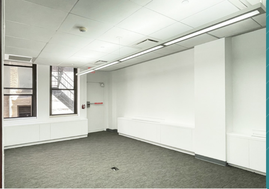
Executive Office/Meeting Room