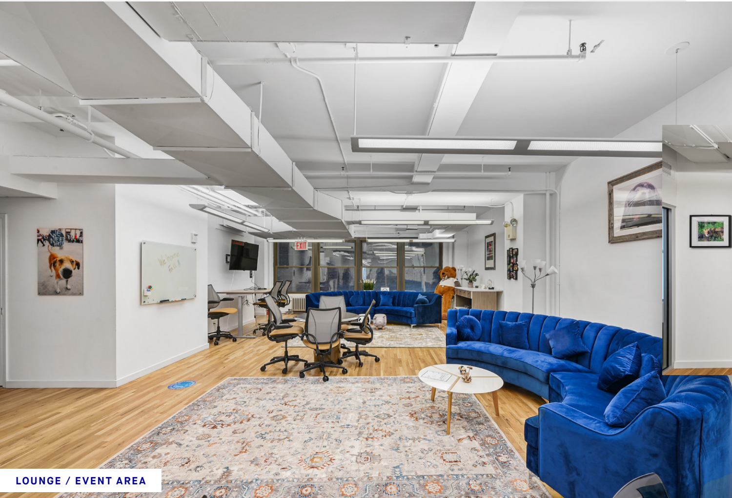
LOUNGE / EVENT AREA