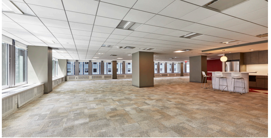
OPEN WORK AREA WITH PANTRY