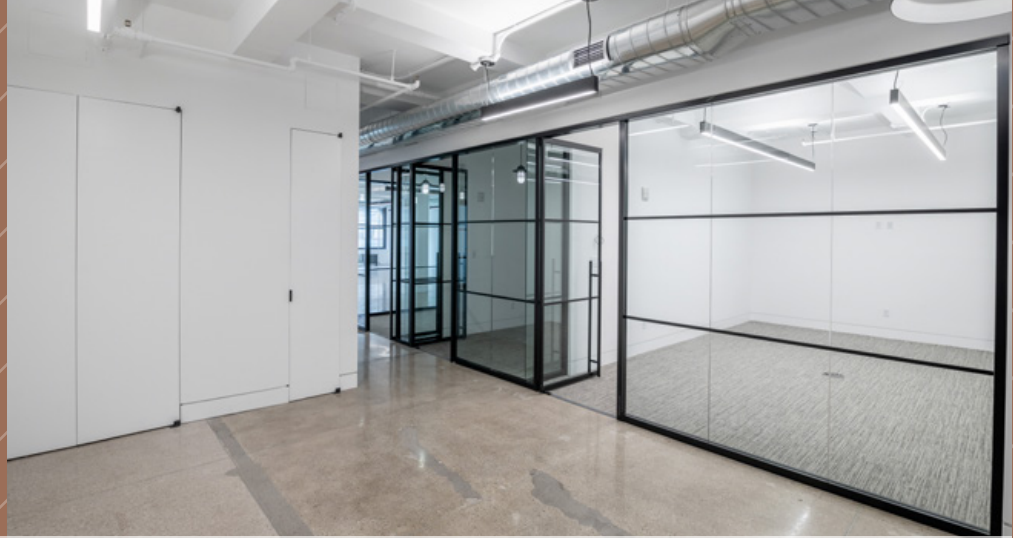
Sample Building Standard Finishes