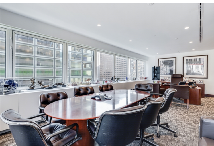
Executive Office 2