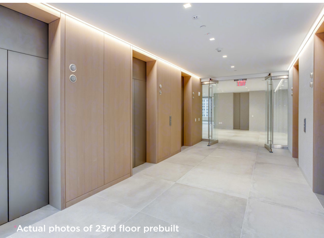
Actual photos of 23rd floor prebuilt