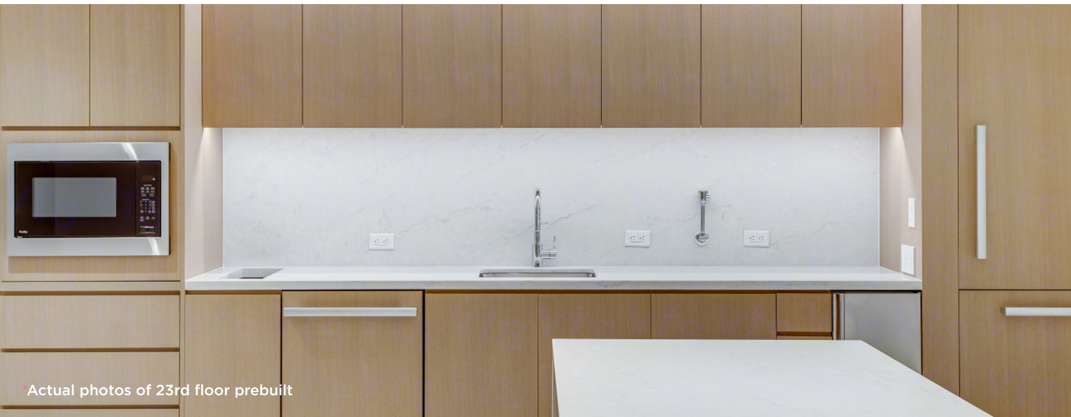
Actual photos of 23rd floor prebuilt