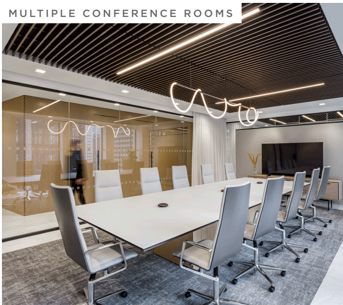
MULTIPLE CONFERENCE ROOMS