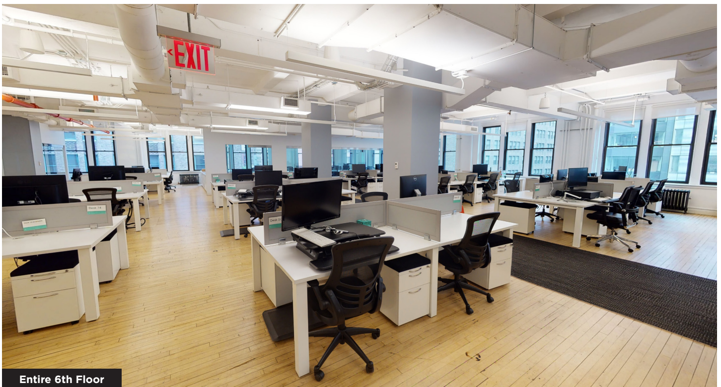
Entire 6th Floor