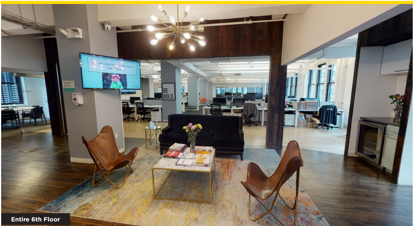
Entire 6th Floor