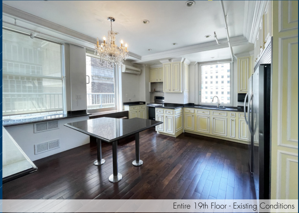
Entire 19th Floor - Existing Conditions