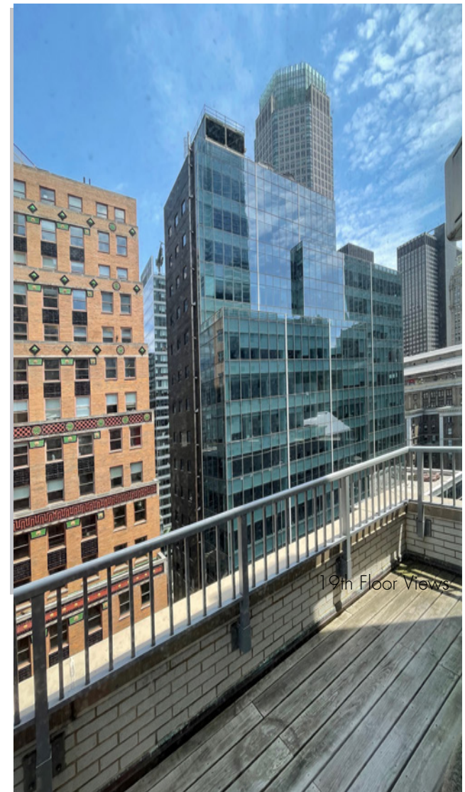
19th Floor Views

Suite 1201: 965 rsf ( Deal Pend. ) Immediate $39.50 psf - (1) windowed office plus (2) additional interior offices