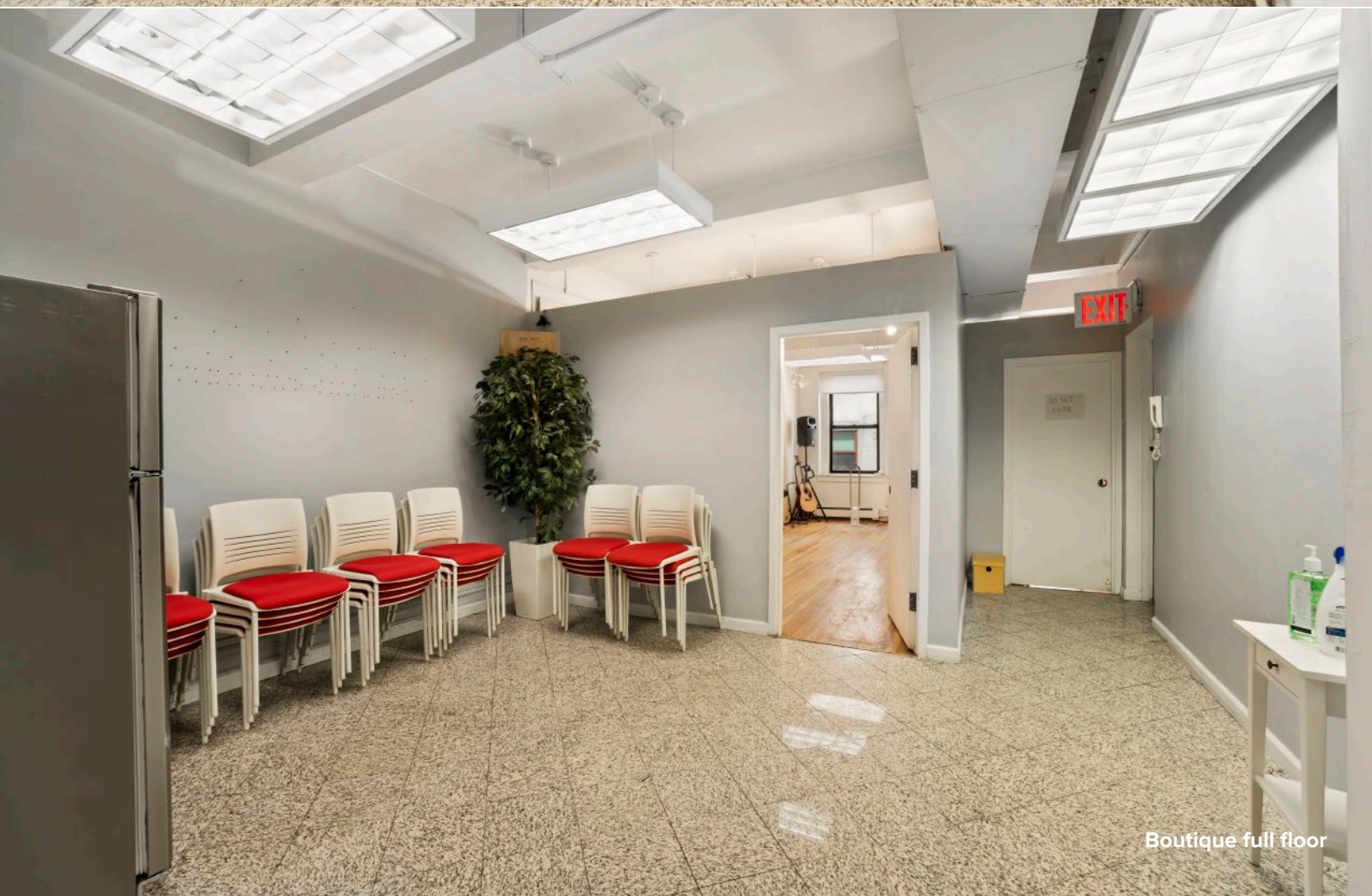
Boutique full floor