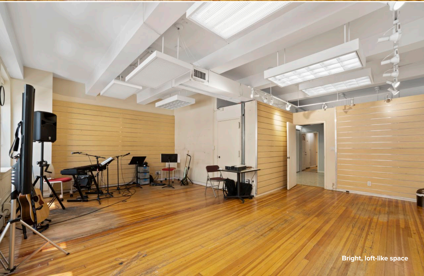
Bright, loft-like space