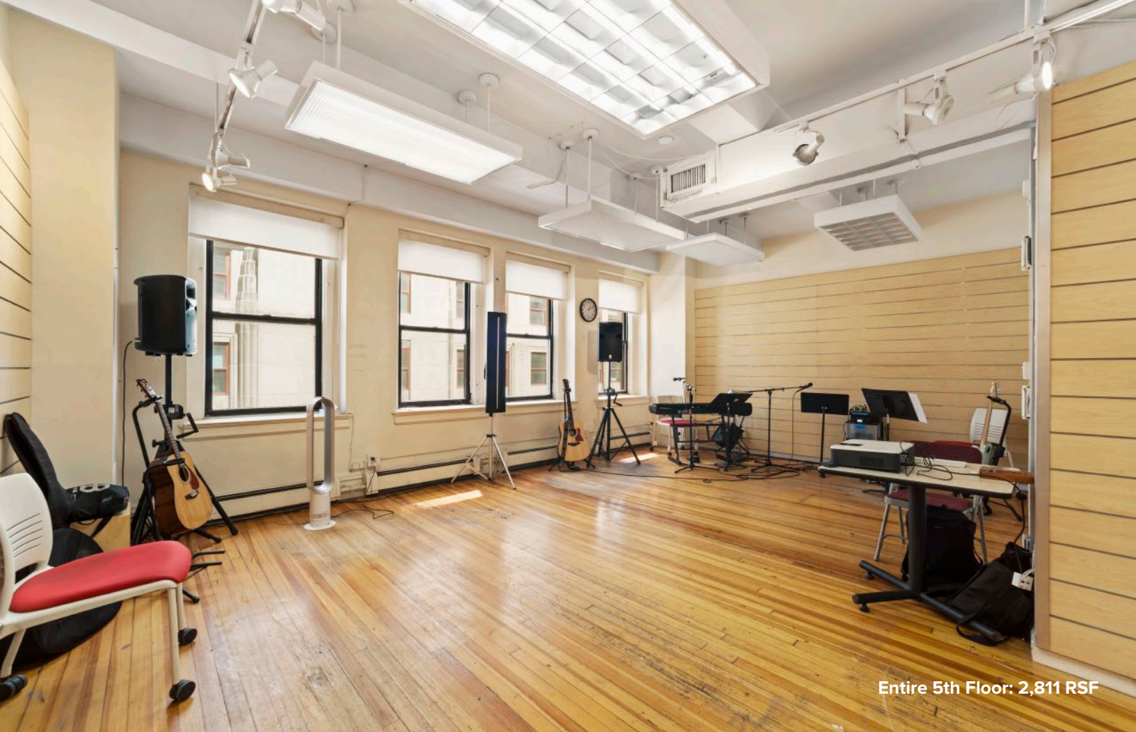
Entire 5th Floor: 2,811 RSF