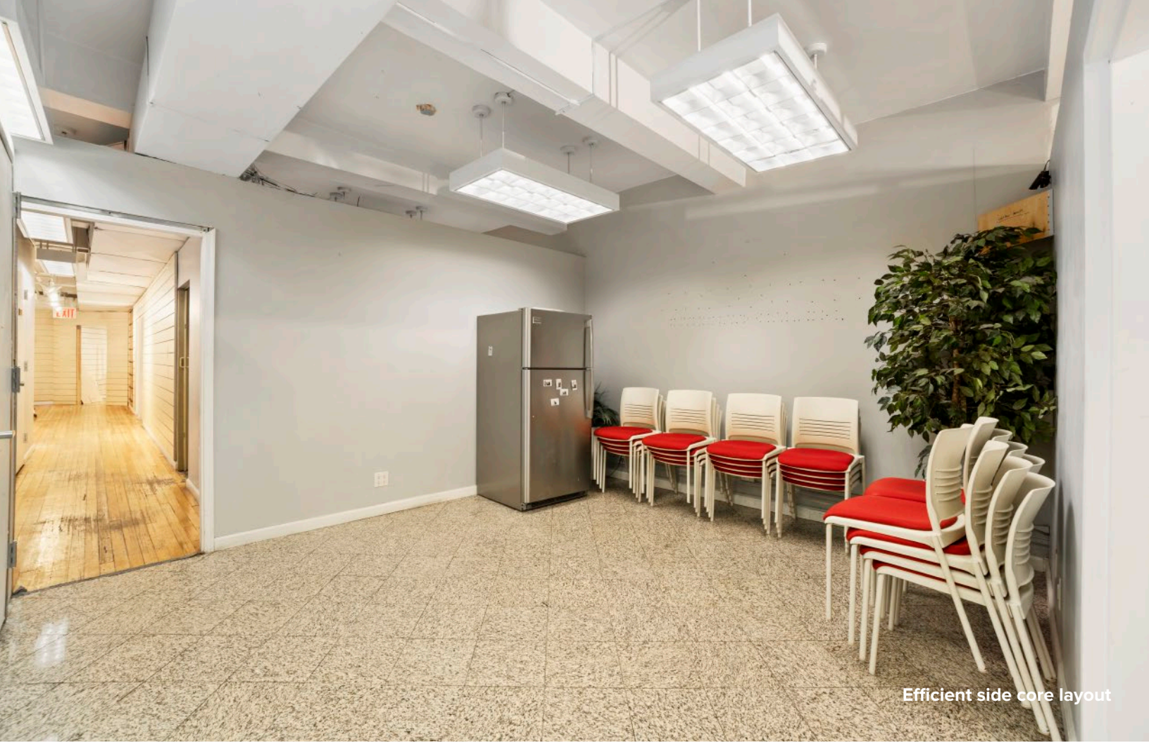
Efficient side core layout