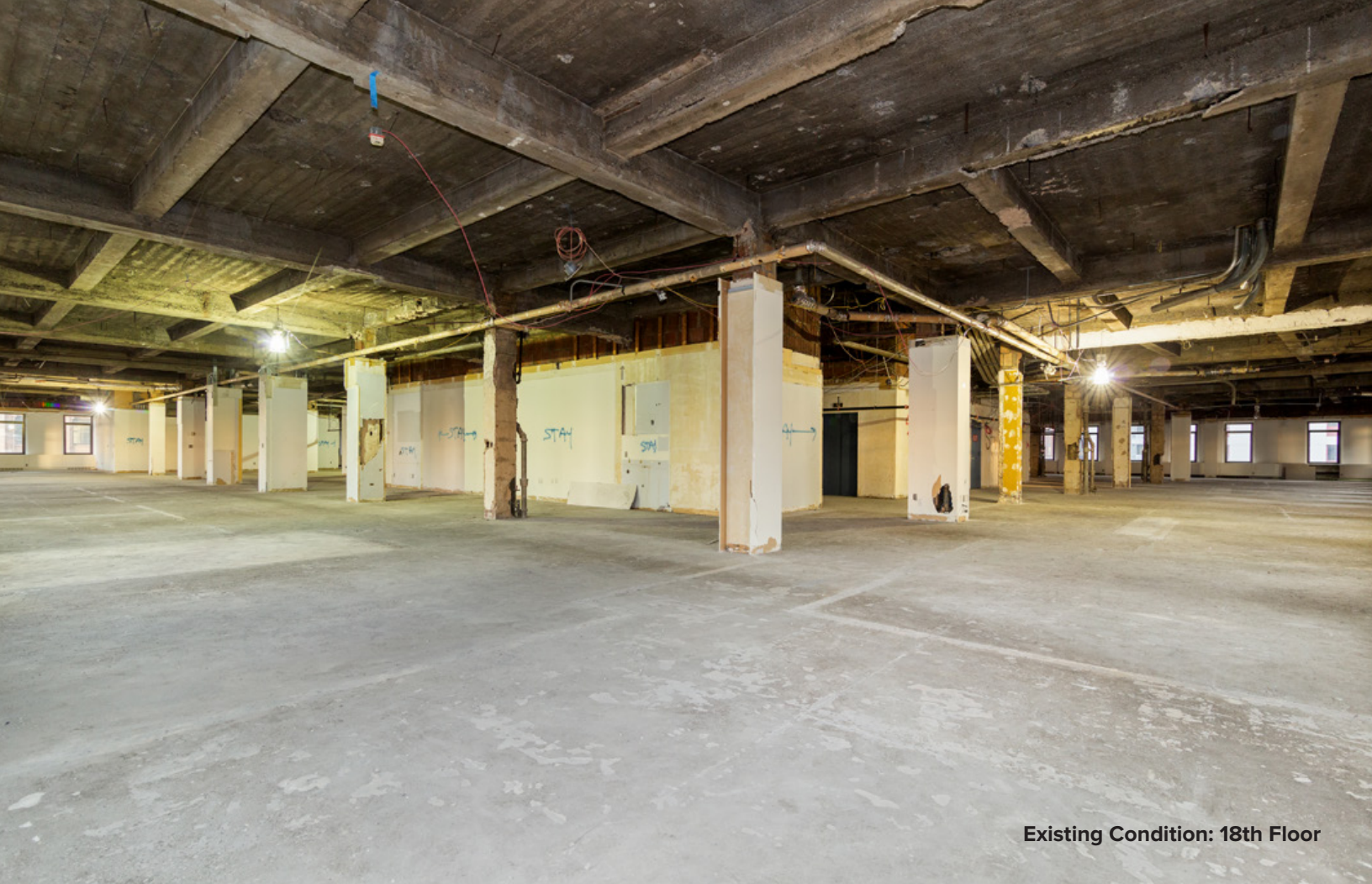
Existing Condition: 18th Floor