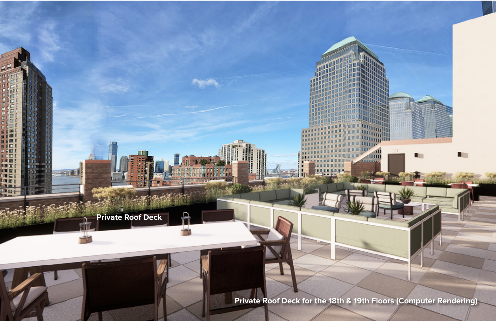
Private Rooftop Deck