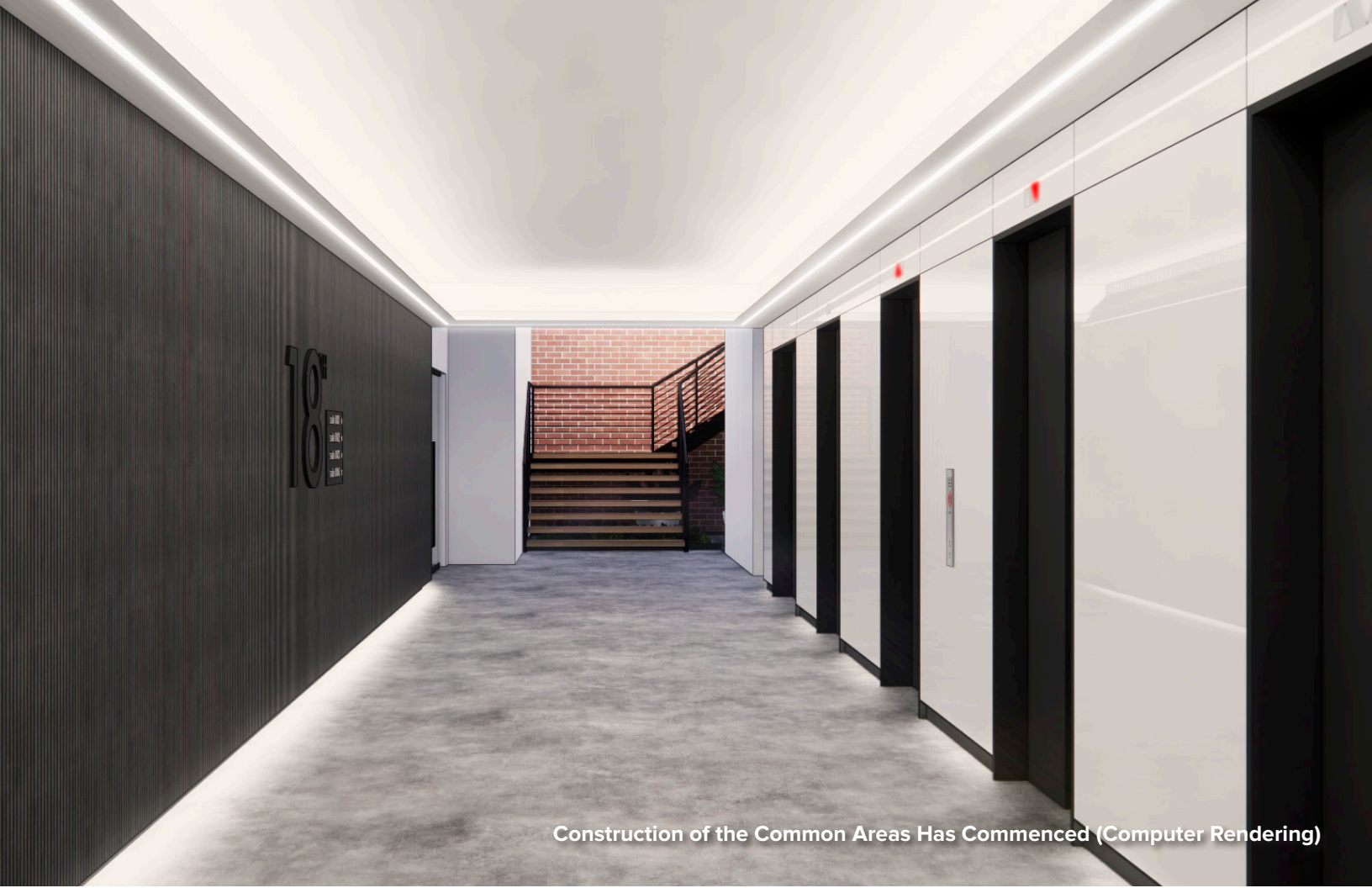
Construction of the Common Areas Has Commenced (Computer Rendering)