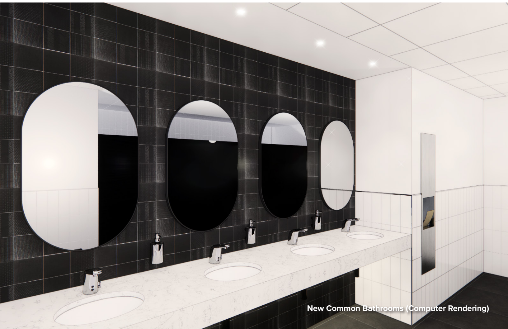
New Common Bathrooms (Computer Rendering)