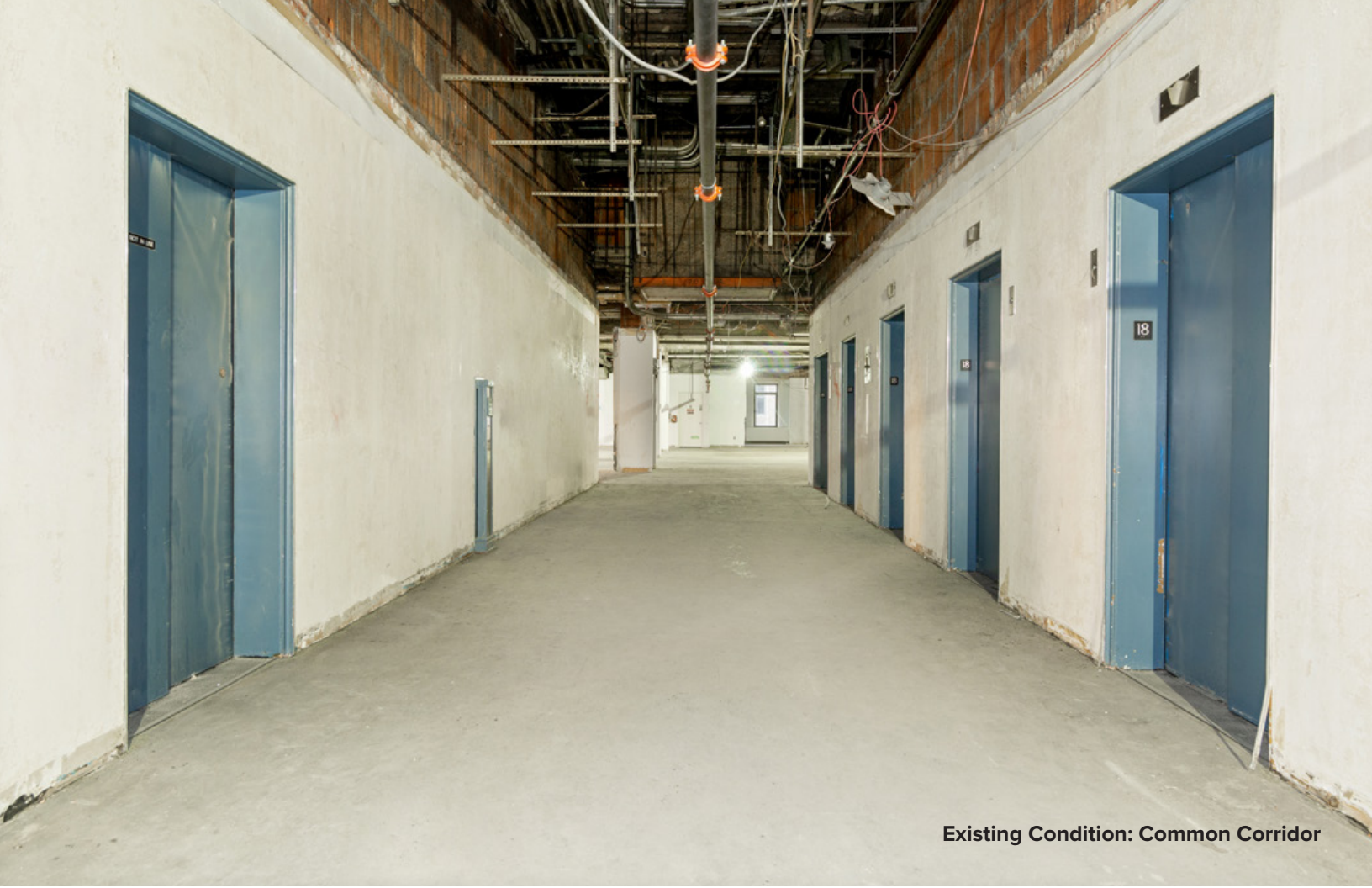
Existing Condition: Common Corridor