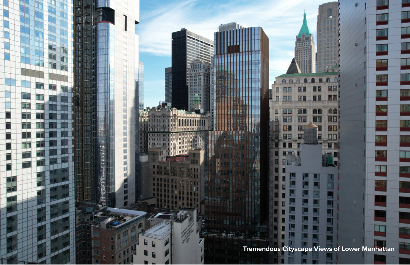
Tremendous Cityscape Views of Lower Manhattan