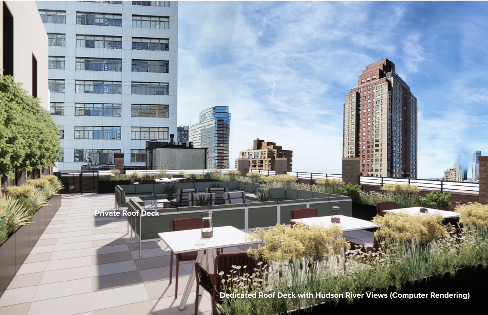
Private Roof Deck