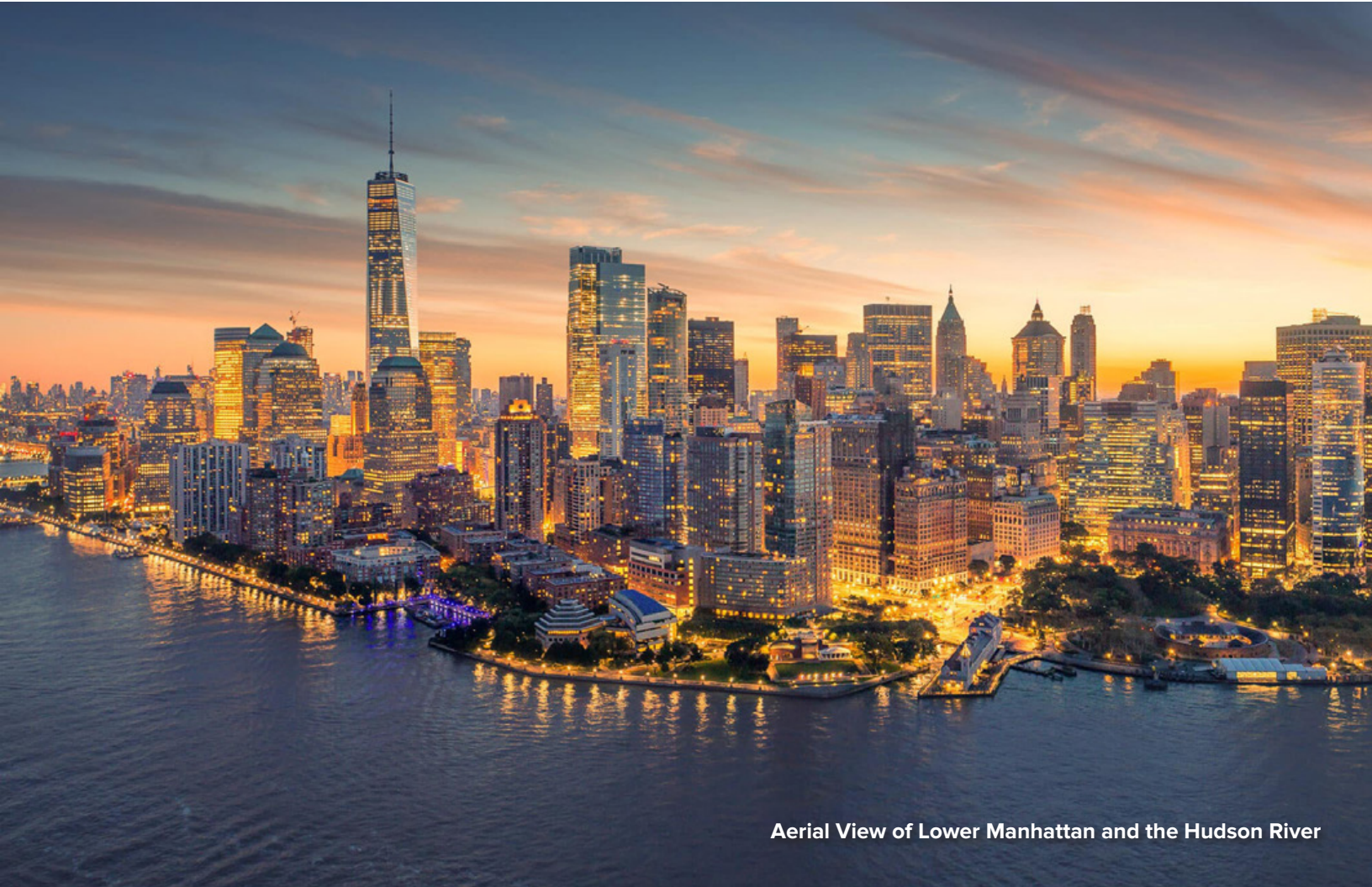
Aerial View of Lower Manhattan and the Hudson River