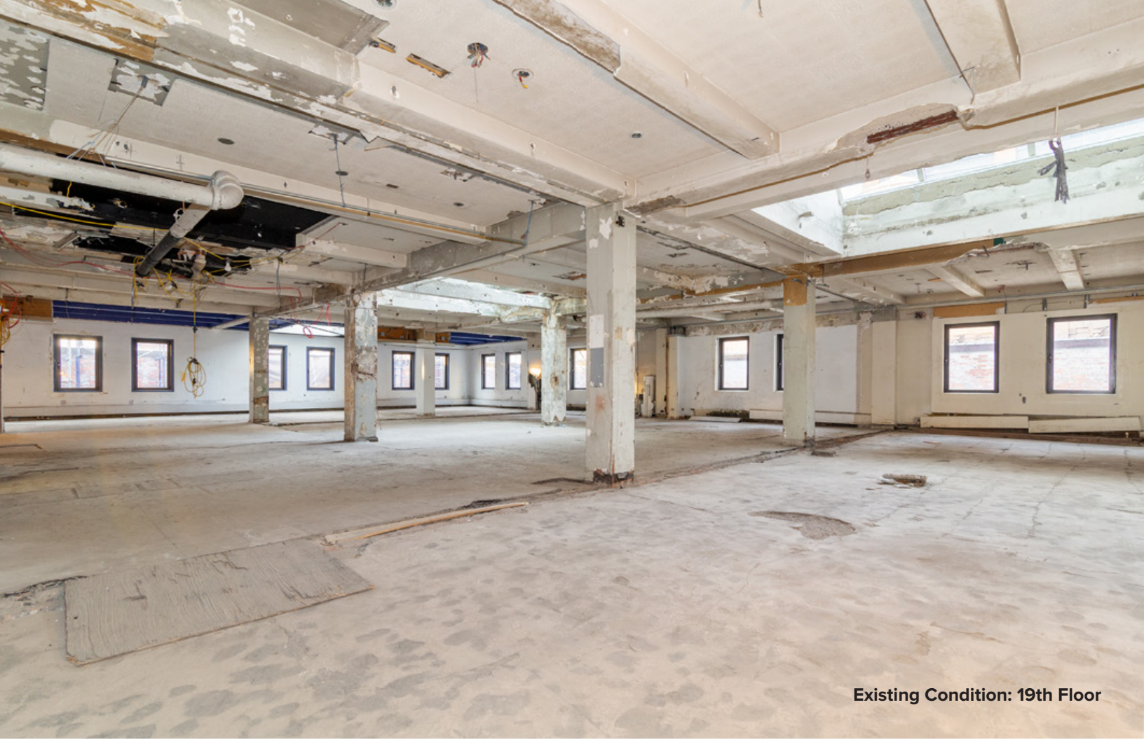
Existing Condition: 19th Floor