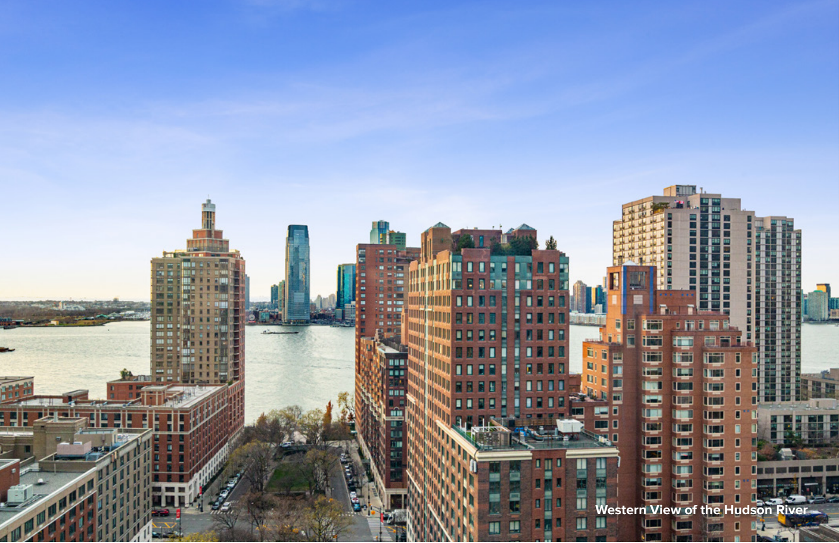
Western View of the Hudson River