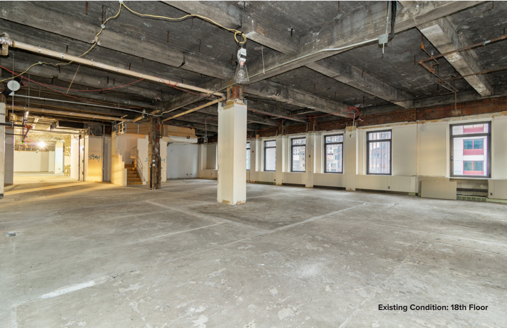
Existing Condition: 18th Floor