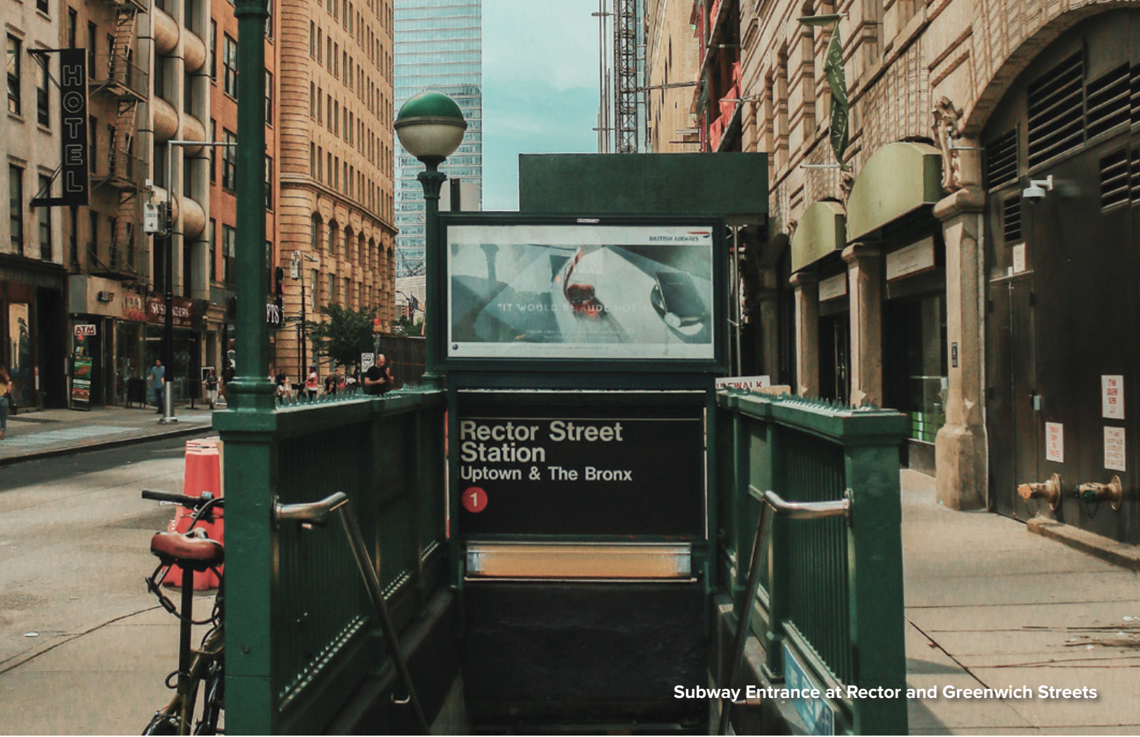
Subway Entrance at Rector and Greenwich Streets