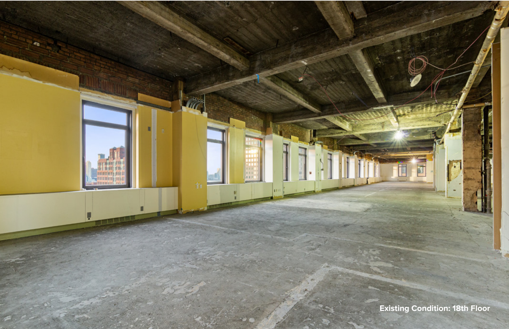
Existing Condition: 18th Floor