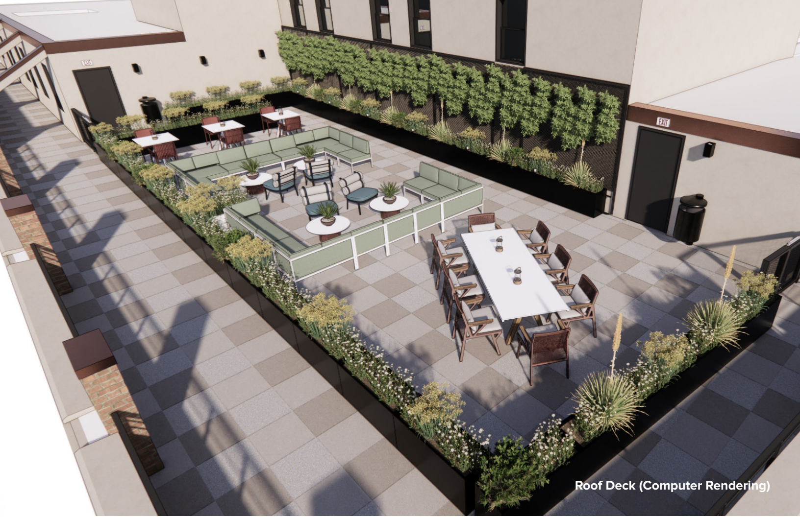
Rooftop Deck (Computer Rendering)