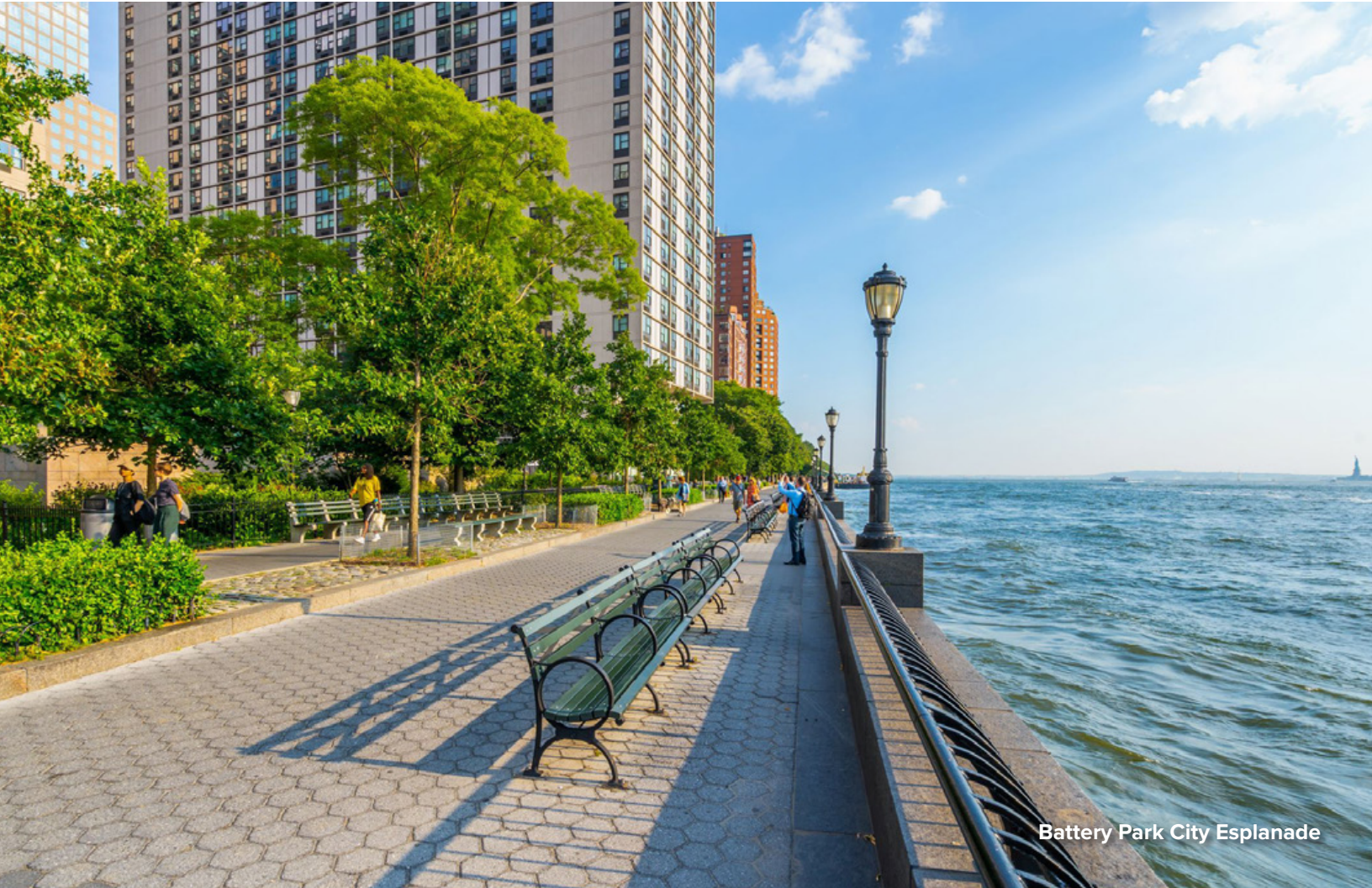
Battery Park City Esplanade