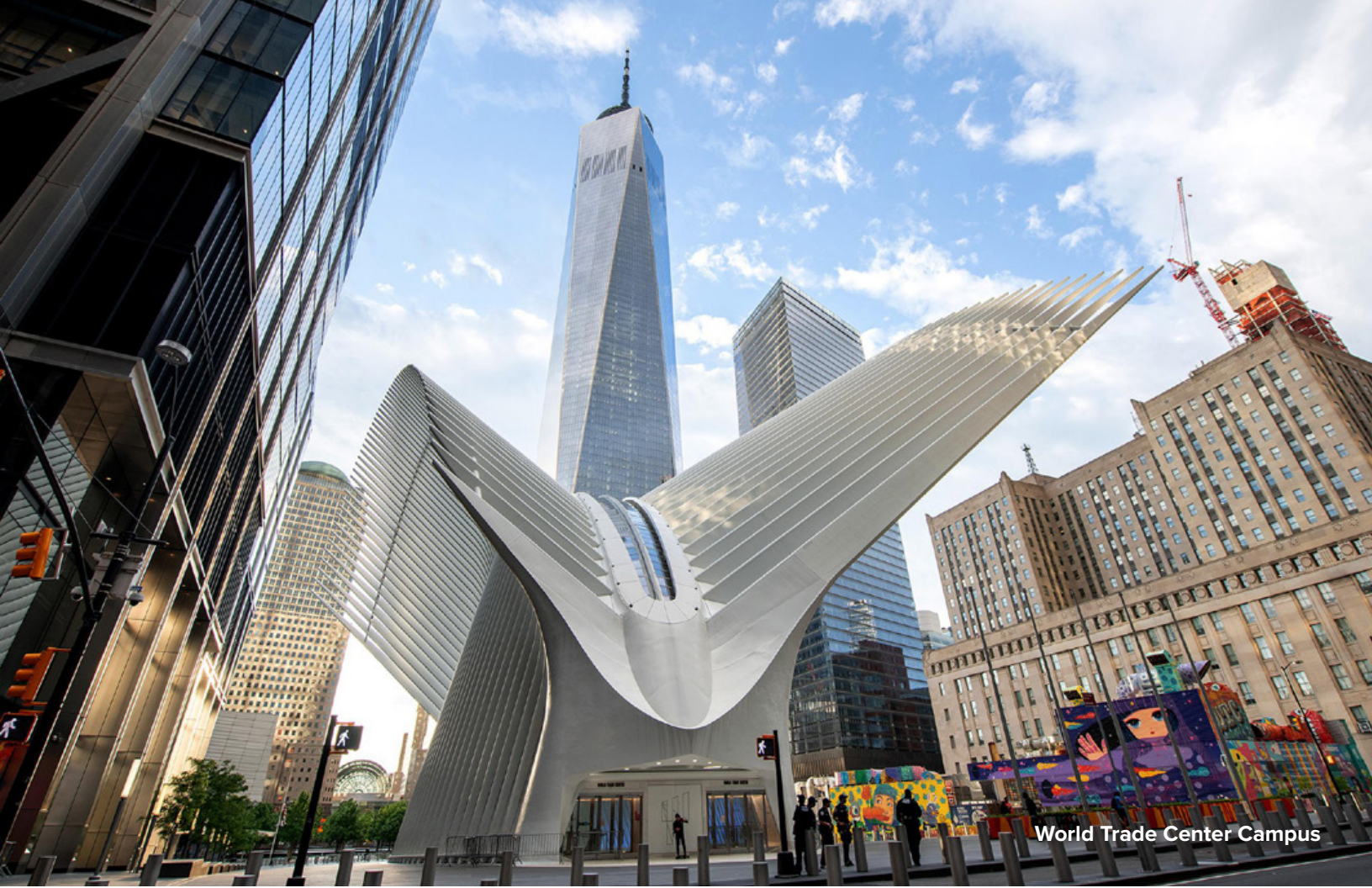
World Trade Center Campus