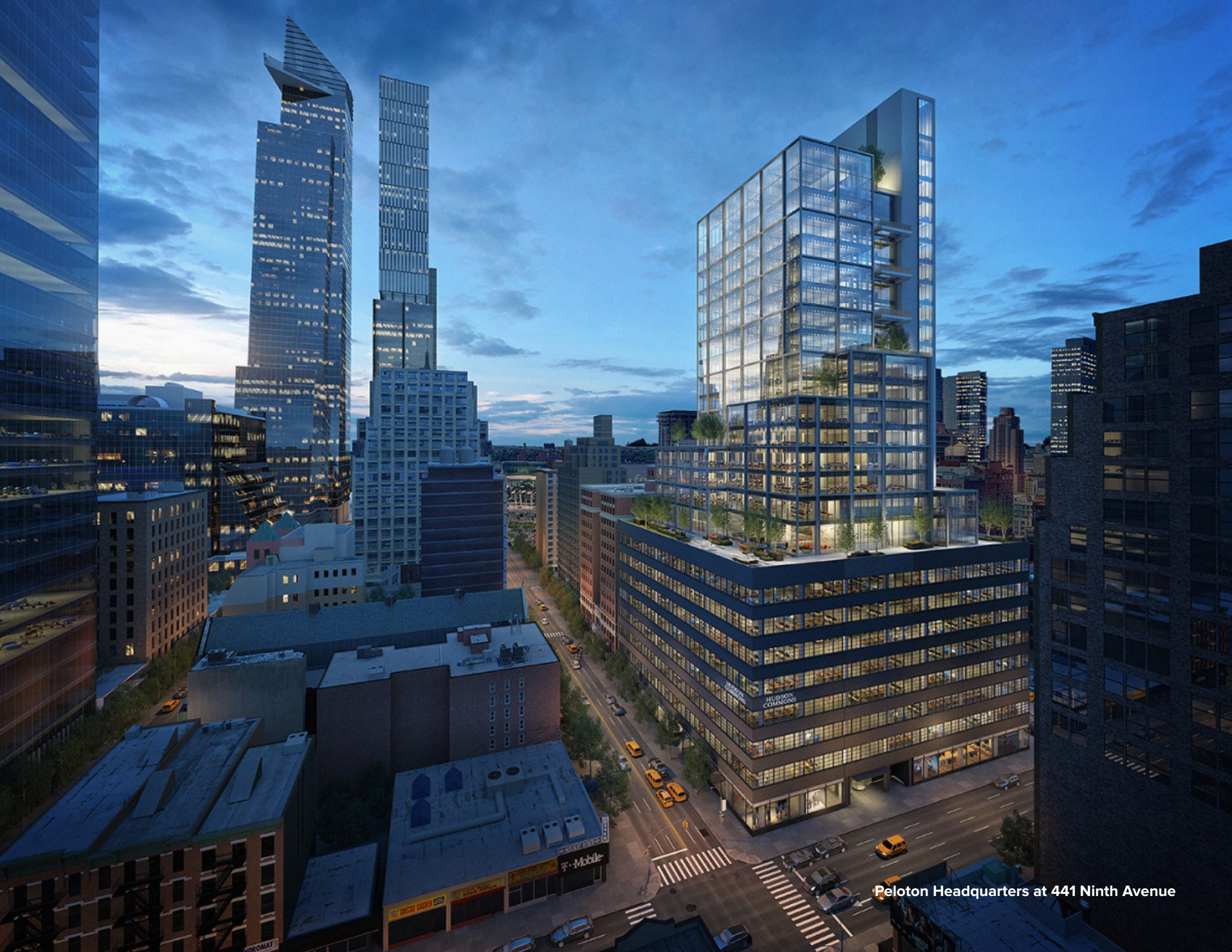
Peloton Headquarters at 441 Ninth Avenue