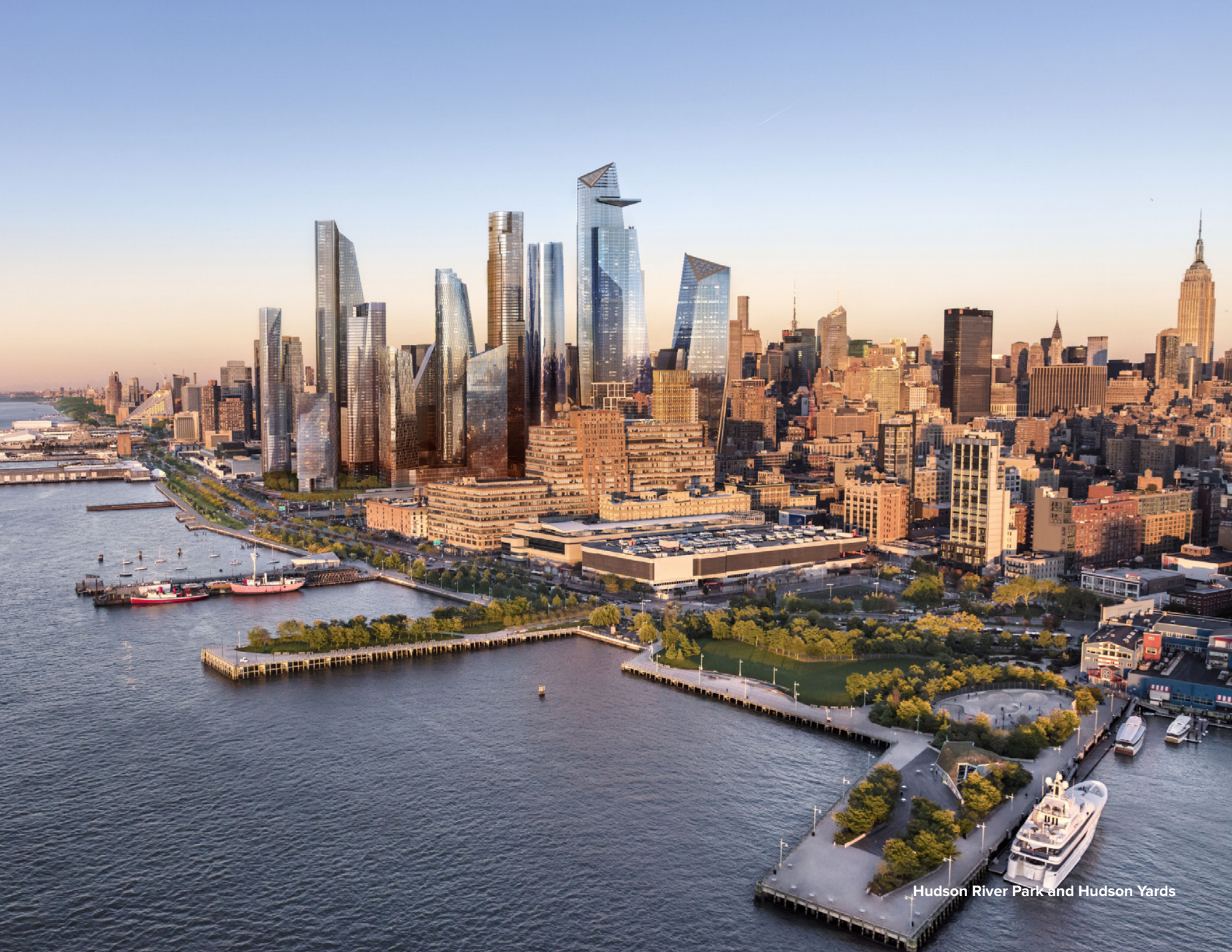
Hudson River Park and Hudson Yards