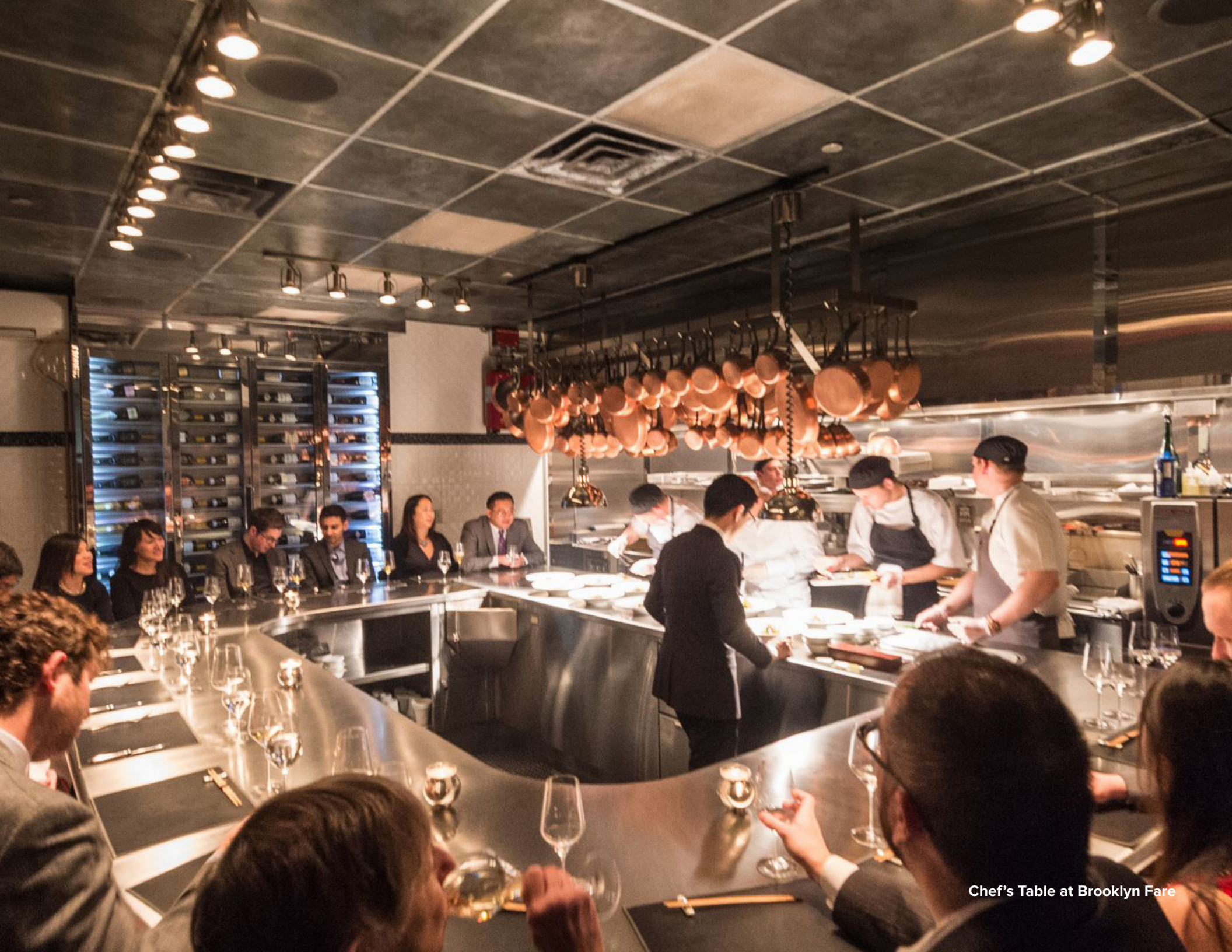
Chef's Table at Brooklyn Fare