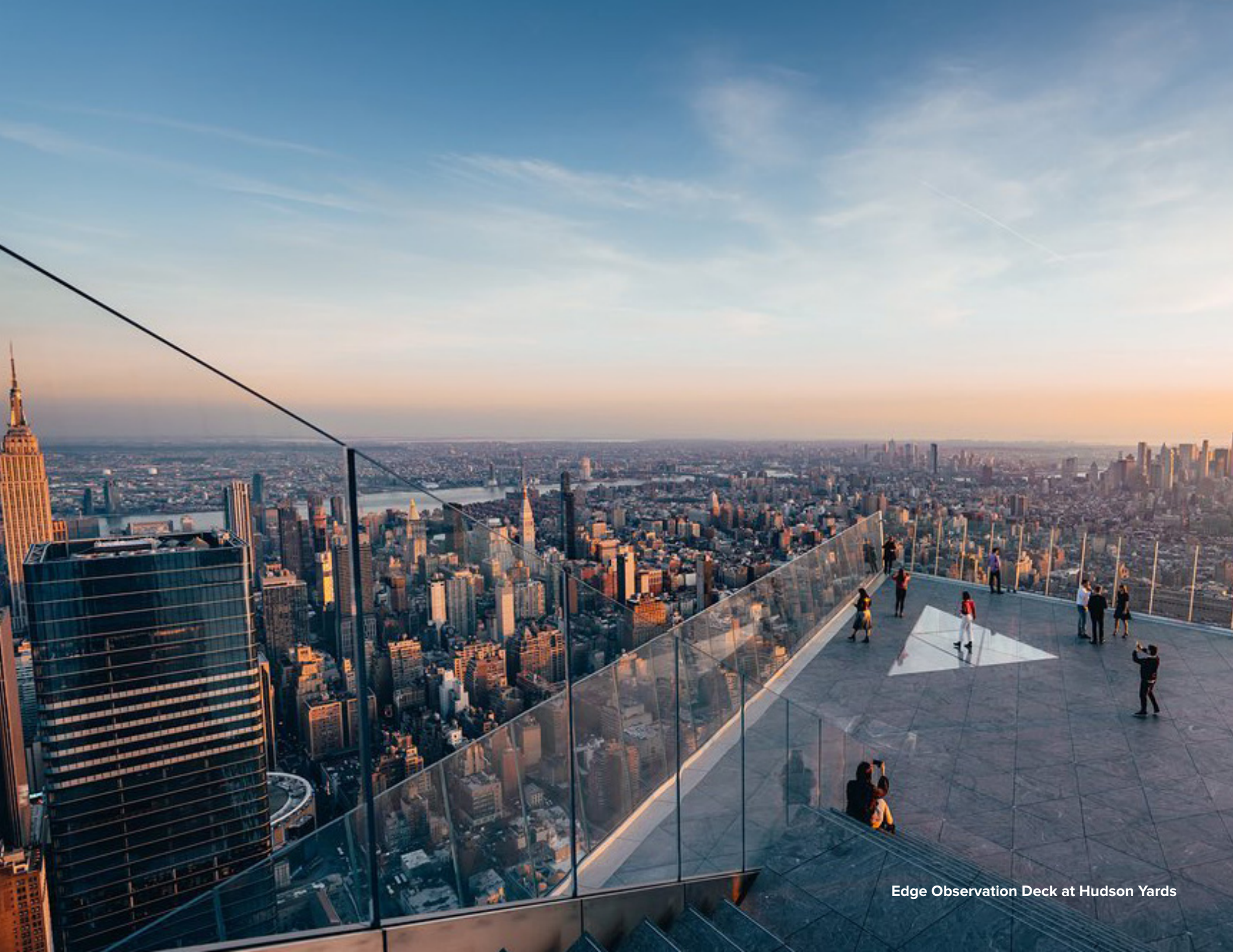
Edge Observation Deck at Hudson Yards